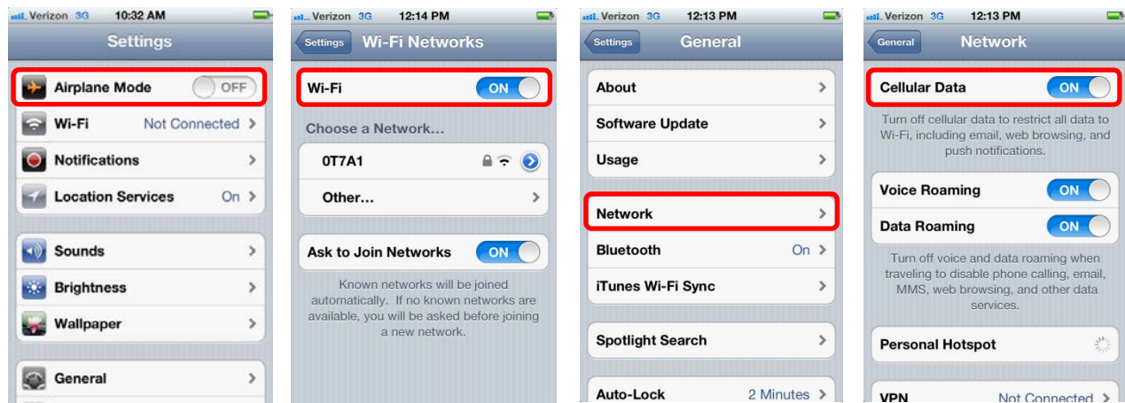
Airplane Mode OFF

Jobulator mobile requires some type of internet connection in order to function properly. Airplane mode must be OFF and you must have either a Wi-Fi or Mobile Network (3G, 4G) connection set up. You can turn on Wi-Fi and connect to a network under Settings . Or you can check your 3G or 4G connection under Settings, General Settings, Network.